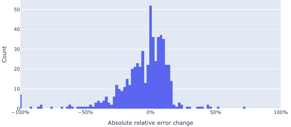
Figure 2: Relative error change under the ECPS compared to the better performing of the CPS or PUF for each target.